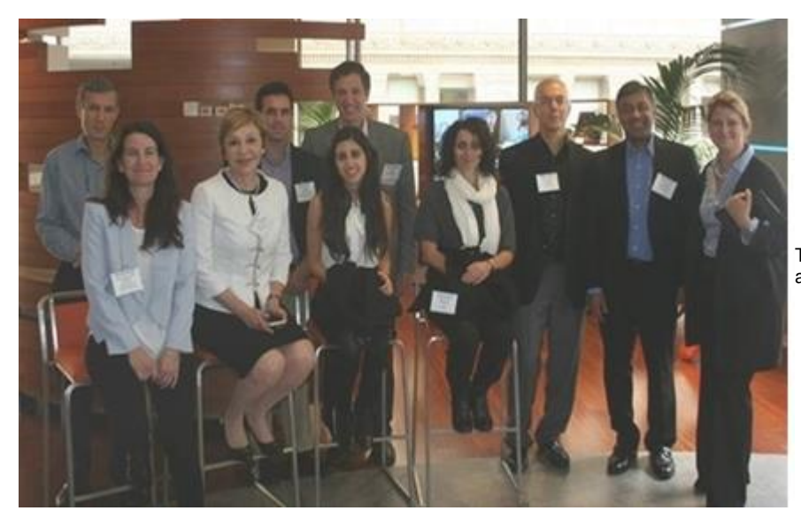
The Israeli Digital Health Delegation visit atMcKesson Corporation

The visit to NY, Boston & San Francisco offered a unique opportunity for the companies to present their technologies to leading hospitals and have pre-arranged meetings with companies such as Khosla Ventures, Samsung Strategy & Innovation Center, Google Ventures and McKesson. In addition, the Israeli companies met with hospitals such as NYU Langone Hospital, Brigham and Women's Hospital in Boston, Stanford Hospital & USCF Hospital in San Francisco.