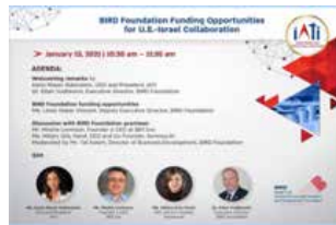
IATI & BIRD Foundation Funding Opportunities (IATI) January 13, 2021