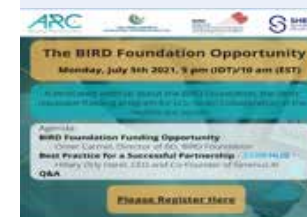
The BIRD Foundation Opportunity July 5, 2021