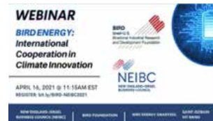
How BIRD Funding Helps Fight Global Warming (NEIBC) April 16, 2021