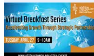
Accelerating Growth Through Strategic Partnerships (Arizona Tech Council) April 27, 2021