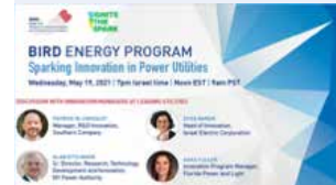
BIRD Energy Program: Sparking Innovation in Power Utilities May 19, 2021