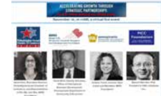
BIRD Foundation Funding US-Israeli Innovation November 10, 2021