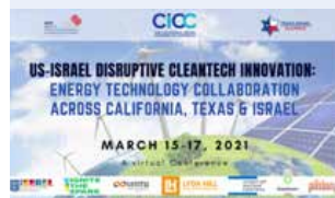
U.S.- Israel Disruptive Cleantech Innovation (CICC) March 15-17, 2021