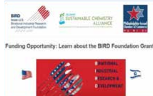
Funding Opportunity: Learn about the BIRD Foundation Grant (PICC) February 2, 2021