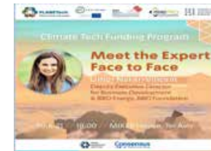
Climate Tech Funding Program - Meet the Experts Face to Face June 30, 2021