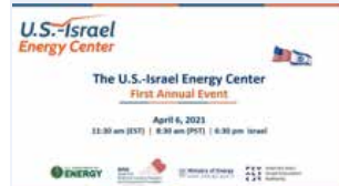
U.S. - Israel Energy Center First Annual Event Webinar April 6, 2021