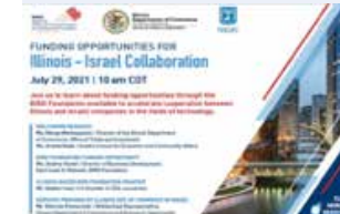
Funding Opportunities for Illinois – Israel Collaboration July 29, 2021