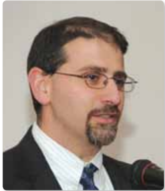
Mr. Dan Shapiro U.S. Ambassador

At the U.S. Embassy, we are proud of and honored by our close and active relationship with the BIRD Foundation. During my tenure as Ambassador, I have witnessed BIRD's continuous evolution and expansion into new areas of U.S.-Israel industrial R&D collaboration.